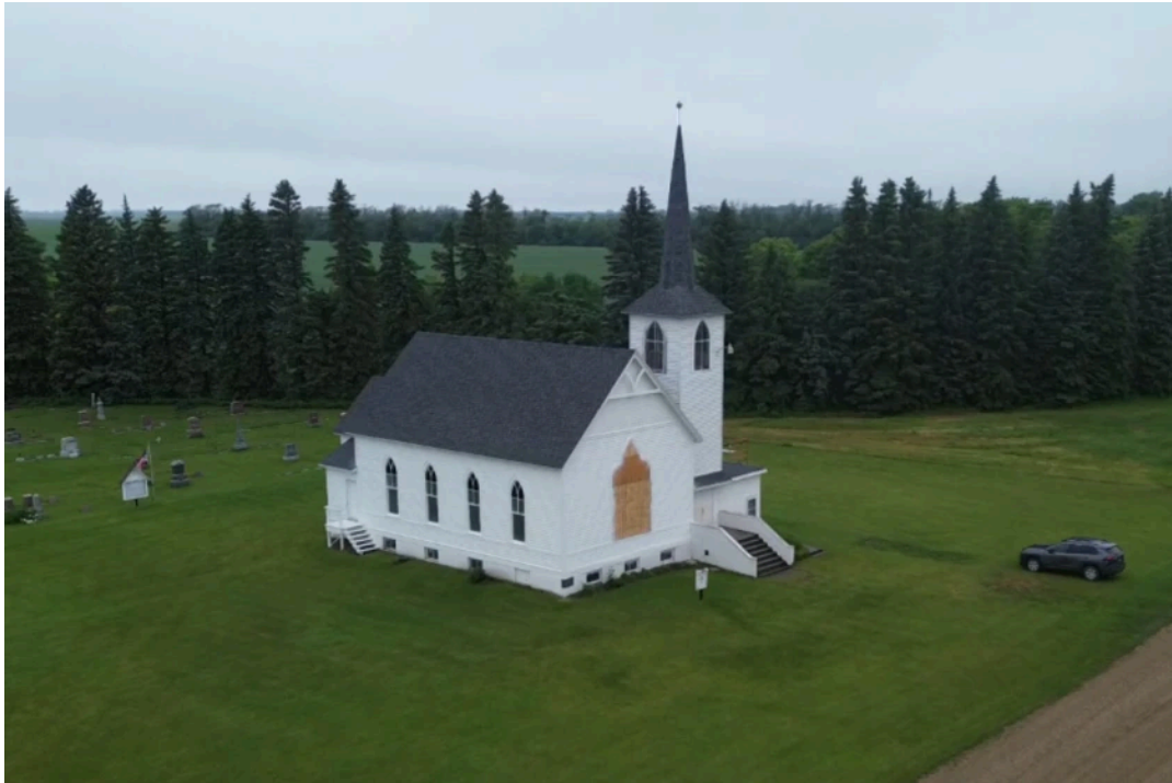
The Historic Grue Church in Buxton, North Dakota.

The church shut down in 2020, but former worshippers quickly decided to make use of the historic building.